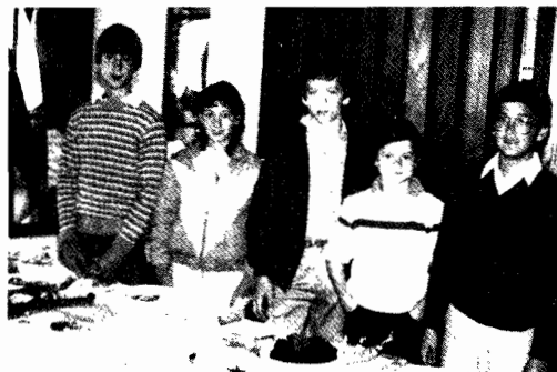
Eighth graders vend their baked goods to benefit the poor.