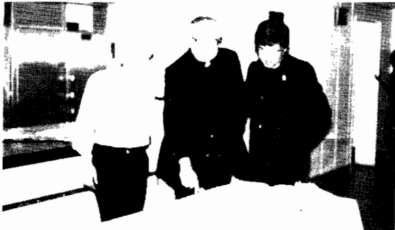
Scenes from the Great Columbus Day Bash