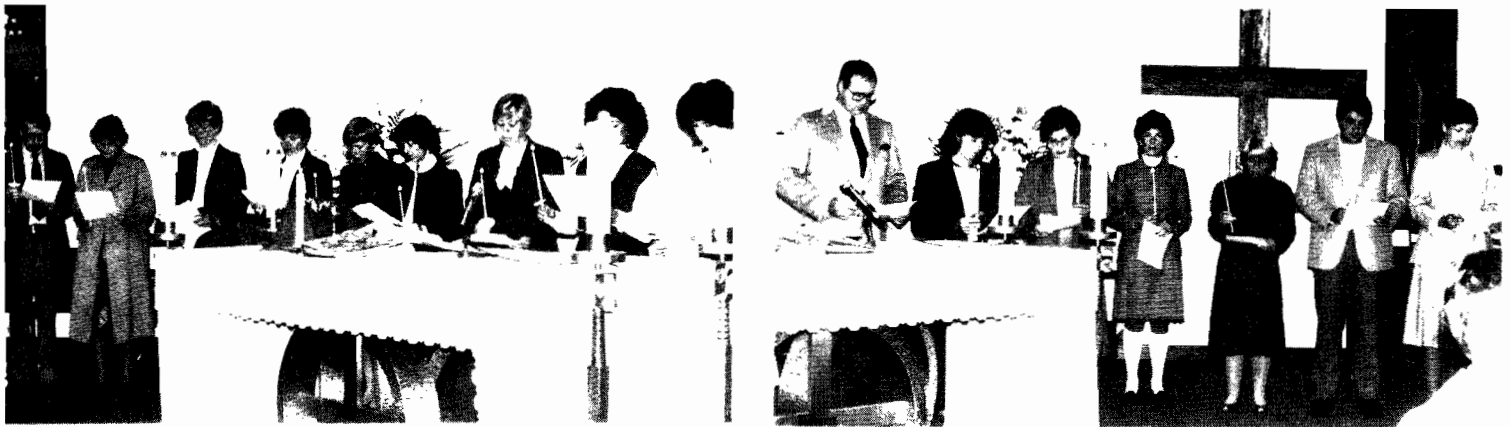
Teachers' Commissioning Service

The well publicized special events such as the Autumn Extravaganza, the Mystery Trip, the Halloween Masquerade Party, a Thanksgiving Service Project and the Christmas Party are examples of how the Youth Ministry Program attempts to involve all aspects of young high school students' lives.