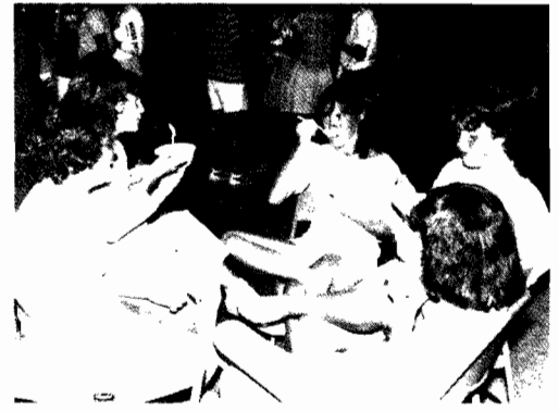
Teenagers enjoy themselves at Midsummer Bash

ST. THOMAS MORE CHURCH 384 MIDDLESEX ROAD DARIEN, CONN. 06820